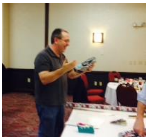
I really want this toy!