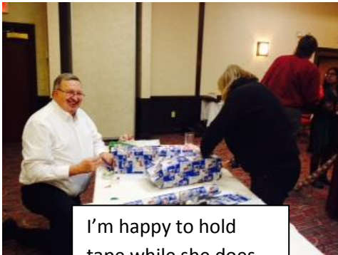
I'm happy to hold tape while she does all the folding!

Wrap once! Tape twice! or was that Wrap, rewrap, then tape?