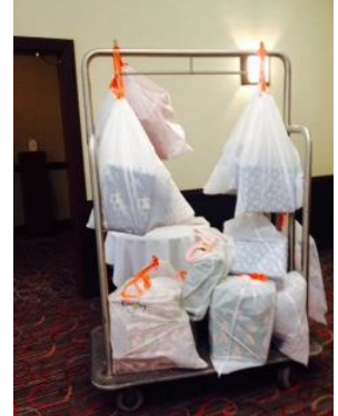
Santa's bags are ready to be delivered.