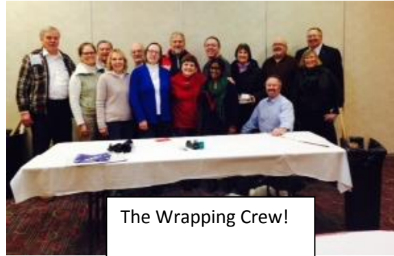
The Wrapping Crew!