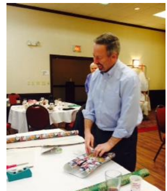
"Is this how it's done?"