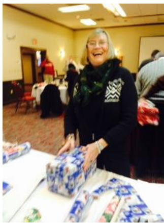
Look! I've got it!