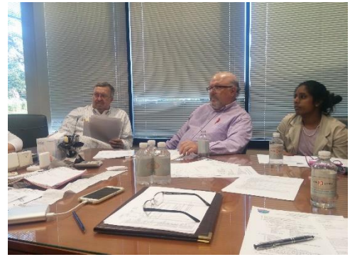
Behind the scenes STOC board members hard at work.