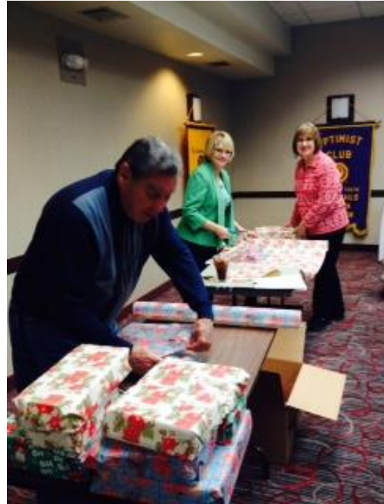
STOC members enjoyed an evening together wrapping gifts for the Lussier Holiday party.