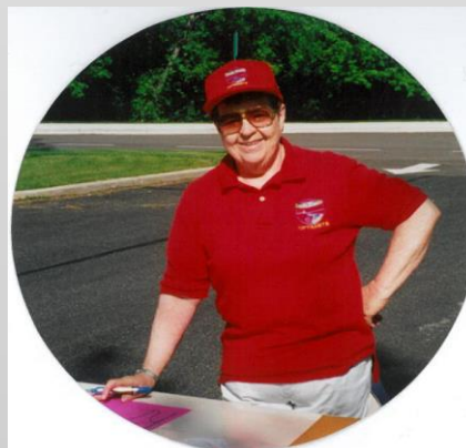
Bike Safety Day