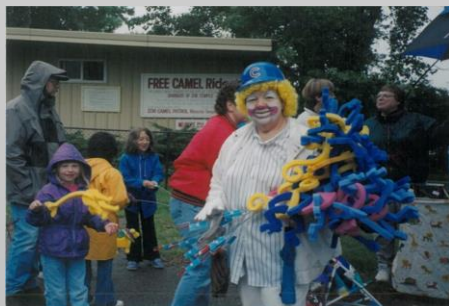
Clowning Around at the Children's Zoo Jubilee