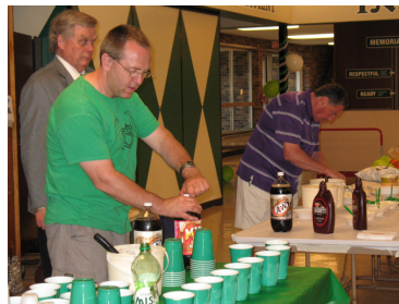
Getting the rootbeer floats and ice cream sundaes ready for the crowd.