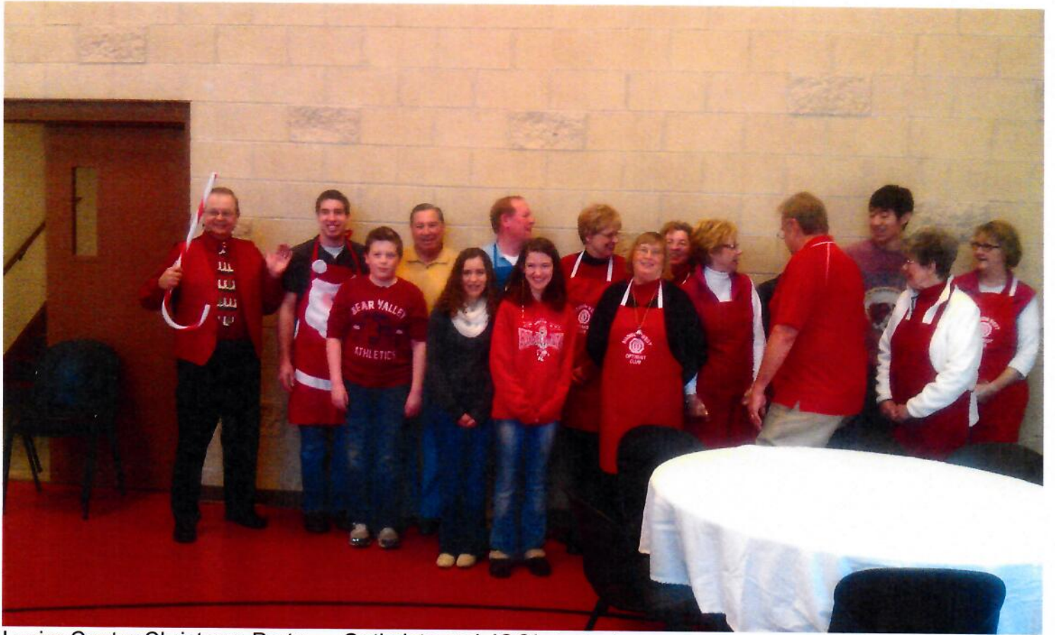
Lusier Center Christmas Party Optimists and JOOI students