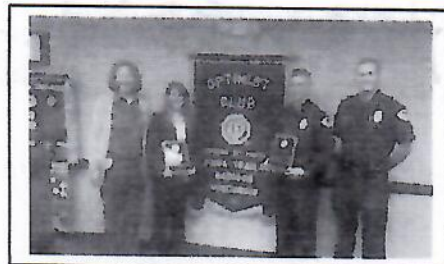
Lt.'s and Officers