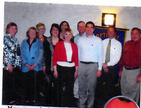
Your newly inducted officers & board.