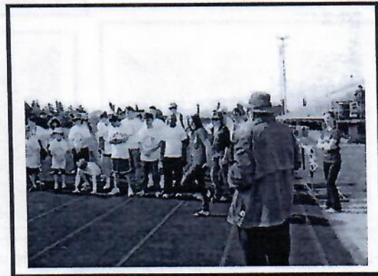
Ready, Set, GO !!!