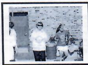
PLANNING & Sauk Trails Optimists